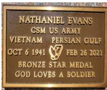
BRONZE NICHE (Z)

This niche marker is 8-1/2 inches long, 5-1/2 inches wide, with 7/16 inch rise. Weight is approximately 3 pounds; mounting bolts and washers are furnished with the marker. Used for columbarium or mausoleum interment. Also provided to supplement a privately-purchased, permanent and durable headstone or marker for eligible Veterans who died on or after November 1, 1990 and are buried in a private cemetery. Additional inscription is limited to 27 characters (including spaces) up to two lines maximum.