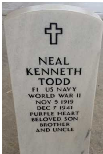
UPRIGHT HEADSTONE WHITE MARBLE (U) OR LIGHT GRAY GRANITE (V)

This headstone is 42 inches long, 13 inches wide and 4 inches thick. Weight is approximately 230 pounds. Variations may occur in stone color, and the marble may contain light to moderate veining. Additional inscription is limited to 15 characters (including spaces) up to four lines maximum.