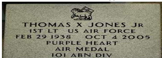
SMALL FLAT GRANITE (L)

This grave marker is 18 inches long, 12 inches wide, and 3 inches thick. Weight is approximately 70 pounds. Variations may occur in stone color. Additional inscription is limited to 27 characters (including spaces) up to two lines maximum.